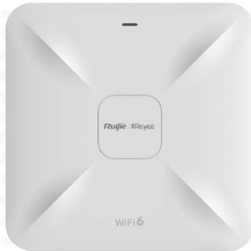
Figure 1-1 RG-RAP2260(G)