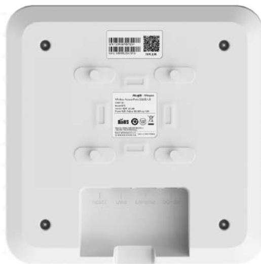
Figure 1-2 RG-RAP2260(G)