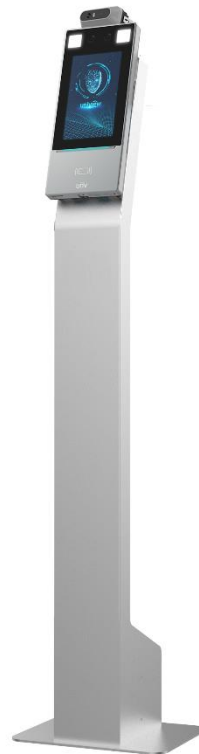
Floor-stand mount (need additional EP-S31-W-NB bracket)